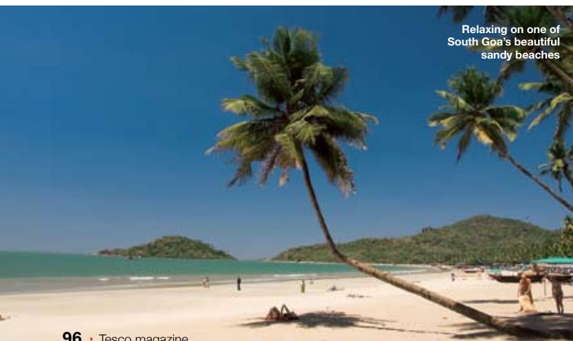
Relaxing on one of South Goa's beautiful sandy beaches

If you fancy a break without the children this summer try these holidays for grown-ups