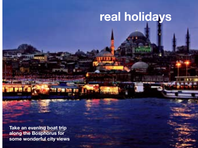
Take an evening boat trip along the Bosphorus for some wonderful city views

Pegasus flies to Istanbul from Stansted, from £39.99 one way, taxes and charges included. See www.flypgs.com . The Lush Hotel ( www.lushhiphotel.com ) starts from £44.50 per person per night, based on two people sharing. And for more information visit www.gototurkey.co.uk .