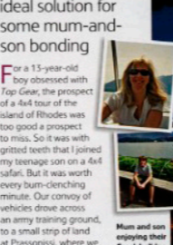
Mum and son enjoying their Greek holiday